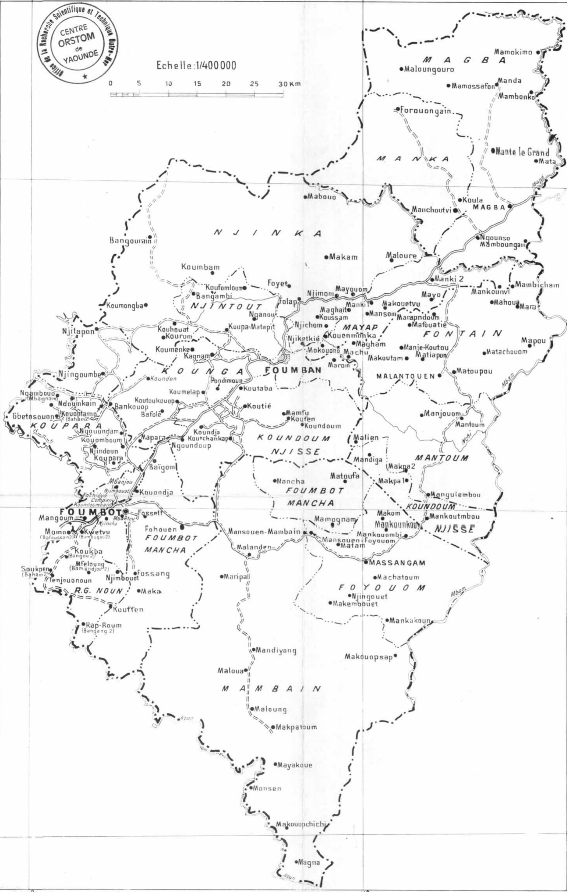
CARTE DES GROUPEMENTS